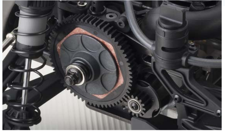
Large slipper clutch installed. Protects drive train from the excessive shock. Minimizes wheel spin.