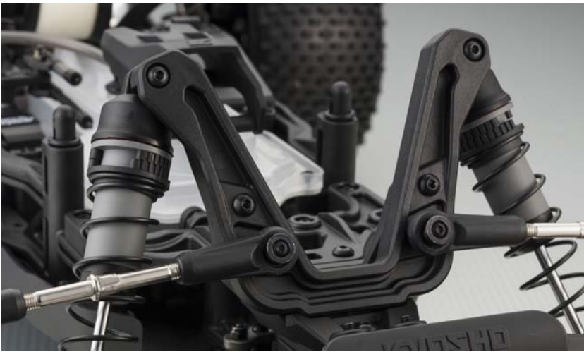
Resin shock stays are resilient under extreme punishment. Use of hard material eliminates unnecessary deflection. Increases effectiveness of suspension.