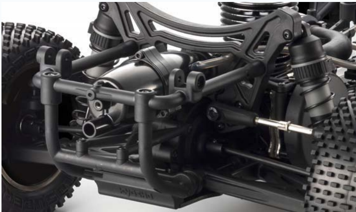
Realistic rear exhaust enhances power and keeps your whip CLEAN.