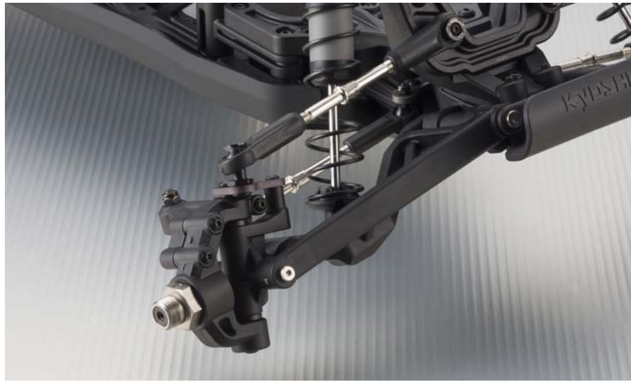
Front knuckle with small scrub setting eliminates the slow steering feel typical of large-scale models.